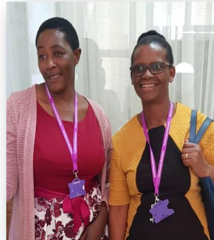
All smiles as data collection takes off in Bulawayo, Zimbabwe