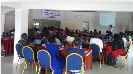
Training at the Department of Nursing, Makerere University, Kampala