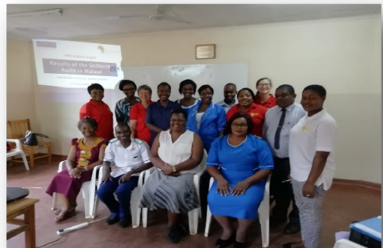
Stakeholder group; Queen Elizabeth Hospital, Blantyre