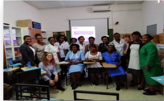
Stakeholder group; Bwaila District Hospital, Lilongwe